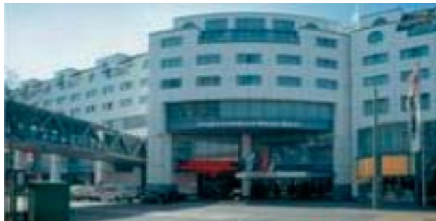
Entrance Conference Site and left the Conference Hotel Swissôtel Basle