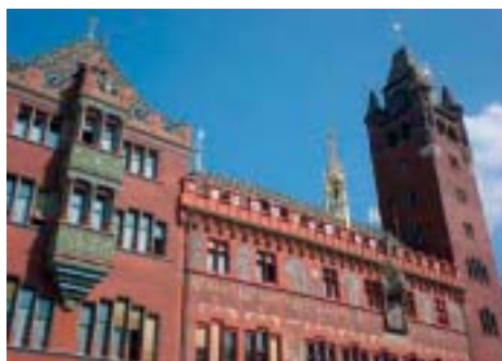
The historic Town Hall of the City of Basle

VDI/VDE-Gesellschaft Mess- und Automatisierungstechnik (GMA) PCIC Europe Postfach 10 11 39 D-40002 Duesseldorf, Germany Telefon +49 (0) 211 62 14-2 15 Telefax +49 (0) 211 62 14-1 61 E-Mail: rosenzweig@vdi.de www.pcic-europe.com